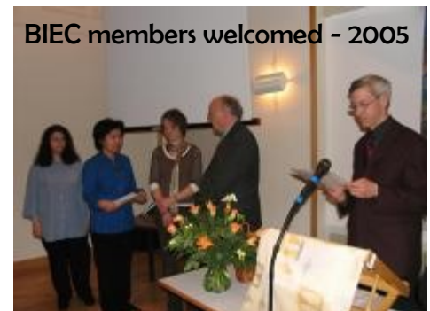
BIEC members welcomed - 2005

Believing it is the will of God that the followers of Jesus Christ associate themselves in fellowship for the worship of God and for mutual edification in Christian life in accordance with their common Christian heritage and purpose this church was established on April 1, 2001. After 10 years, you continue to meet together as BIEC for this reason. Plus you are telling others about the wonderful love of God that he made clear for all to see when he sent Jesus, his beloved one and only Son to die for our sins on the cross.