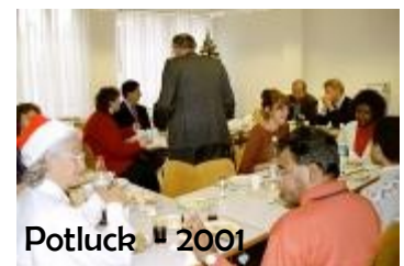
Potluck - 2001

fellowship. In the fall of 1998, we only had six months remaining for work-related stay in Switzerland, and knew that we would definitely be leaving our beloved Switzerland in May of 1999. Nonetheless, God spoke to our hearts and led us to consider launching an evangelical English-speaking church in Bern prior to our departure. But how? With what people? With what finances? And, of course, where? We prayed, and prayed more, for this vision to come to realization.