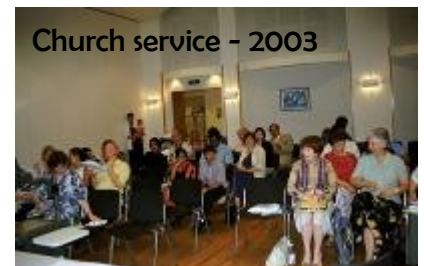
Church service - 2003

So, we did leave Switzerland in May of 1999 and turned-over leadership to others. We learned that there were further challenges and obstacles to surmount, but eventually God's providential workings prevailed and today you are all blessed with the body that has come full-circle and now meets