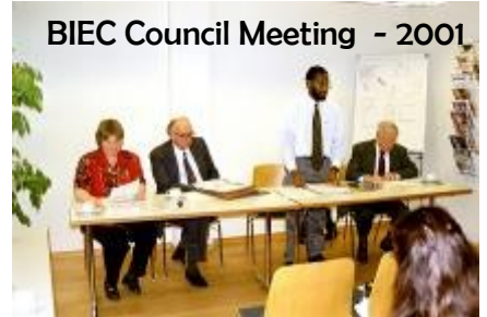
BIEC Council Meeting - 2001