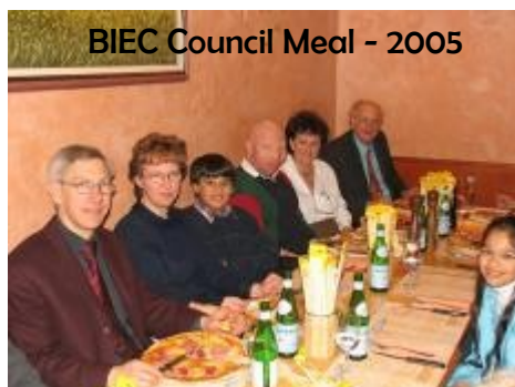
BIEC Council Meal - 2005

What a wonderful message we proclaim. It was a blessing to join with you when we visited several months ago and it was great to see both the "oldies" and the "newies". How glad we are to know that you love each other and serve our Lord Jesus Christ in a spirit of unity.