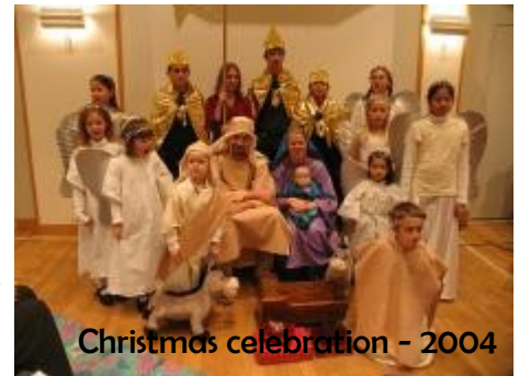
Christmas celebration - 2004