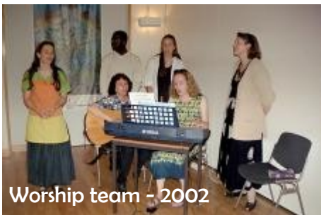
Worship team - 2002

However, not being a recognized mainstream denomination presented barriers to finding a location and we were initially a bit discouraged. Well, after much prayer and reflection, Dave